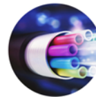
OFC – STRUCTURED CABLING