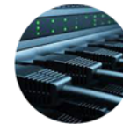
DC POWER PLANT AND AC ELECTRICAL

BUILD AND UPGRADE MOBILE AND FIXED NETWORKS