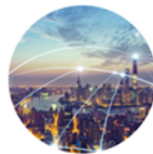
IN BUILDING WIRELESS [DAS & SMALL CELLS]