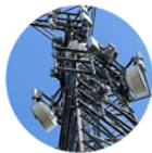
OVERLAY – MACRO [LINES & ANTENNA]

Overlay – MACRO Installation & Integration, IBS – DAS and Small Cell Implementation, Fiber Optic installation – Structured Cabling and DC power plant and AC electric services.