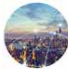
IN BUILDING WIRELESS [DAS & SMALL CELLS]