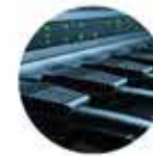
DC POWER PLANT AND AC ELECTRICAL

BUILD AND UPGRADE MOBILE AND FIXED NETWORKS