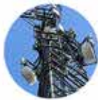
OVERLAY – MACRO [LINES & ANTENNA]

Overlay – MACRO Installation & Integration, IBS – DAS and Small Cell Implementation, Fiber Optic installation – Structured Cabling and DC power plant and AC electric services.