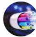
OFC – STRUCTURED CABLING